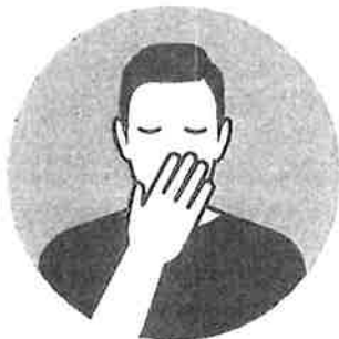
Avoid touching eyes, nose or mouth with unwashed hands