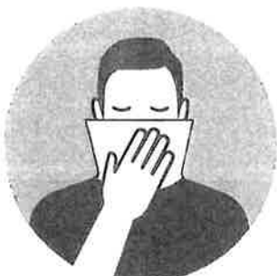
Cover mouth/nose with a tissue or sleeve when coughing or sneezing