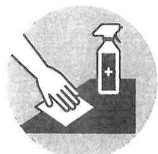
Clean and disinfect frequently touched objects and surfaces