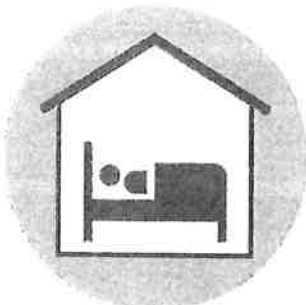
Stay home while you are sick; avoid others