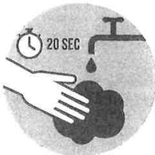
Wash hands often